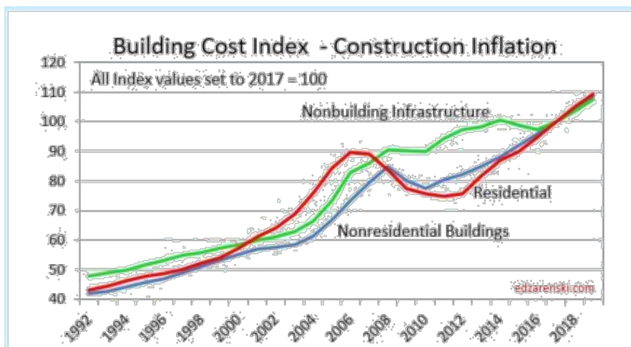
Figure 2: Construction inflation

Construction costs continue to rise across Northern Ireland with the greatest impact being on higher density developments – the primary delivery method within the City Centre. Most developers price City Centre construction at approximately £150 per built sq. ft. As can be seen in figure 2 below, construction costs for residential development have risen consistently since 2012.